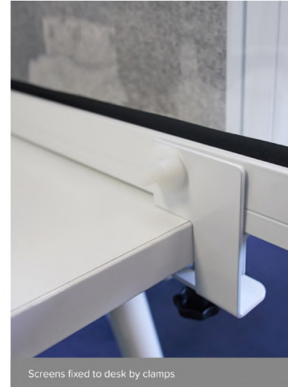
Screens fixed to desk by clamps