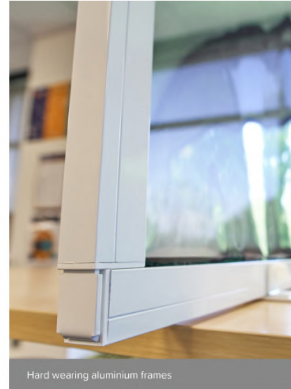
Hard wearing aluminium frames