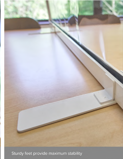
Sturdy feet provide maximum stability